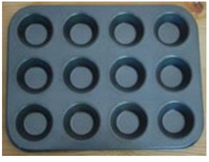
12 \times 2 \div 2 = 12

I took them to school and half of the cakes were eaten, leaving me with twelve cakes: